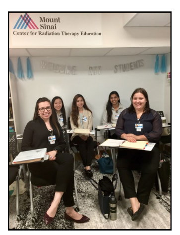
Mount Sinai Radiation Therapy Students Class of 2019

Mount Sinai's Department of Radiation Oncology and Stony Brook University's School of Health Technology and Management have entered into an agreement to provide collaborative radiation therapy education across both campuses. The Mount Sinai Center for Radiation Therapy Education offers students a bachelor's degree in health science through Stony Brook, followed by a year of clinical specialization in radiation therapy through our radiation oncology departments across the Mount Sinai Health System.